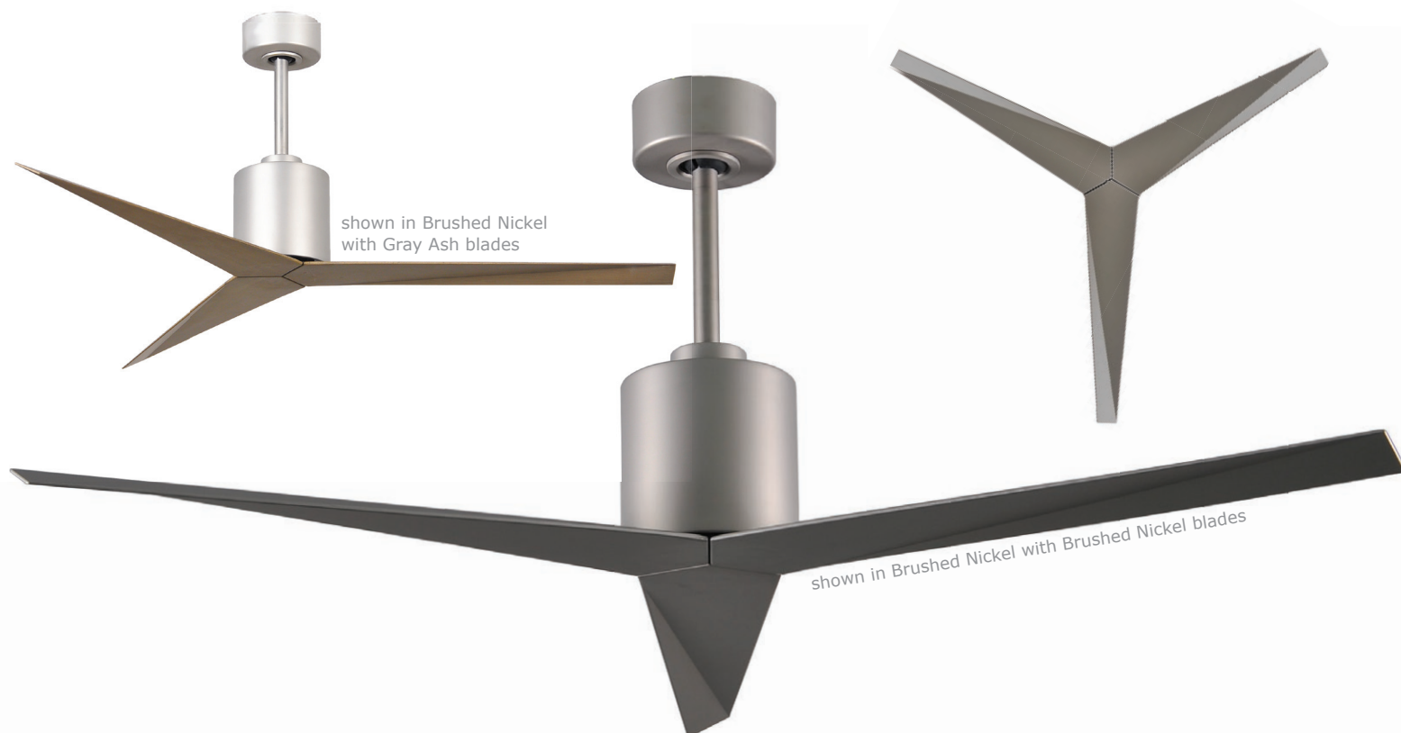
shown in Brushed Nickel with Gray Ash blades