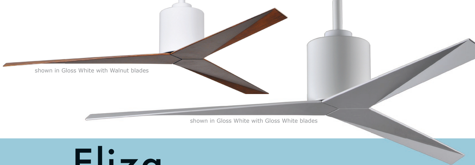
shown in Gloss White with Walnut blades